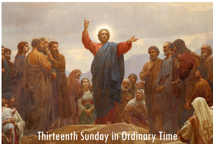
Thirteenth Sunday in Ordinary Time