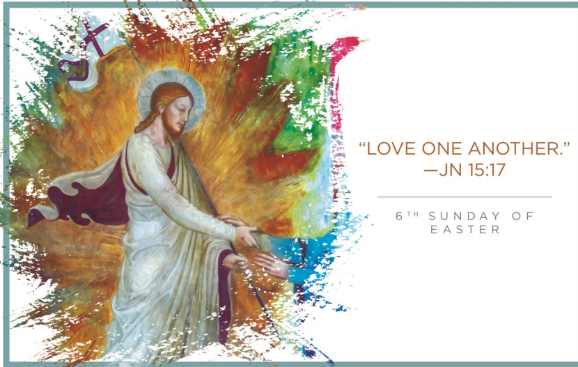
EXCERPTS FROM THE LECTIONARY FOR MASS ©2001, 1998, 1970 CCD. ©LPI