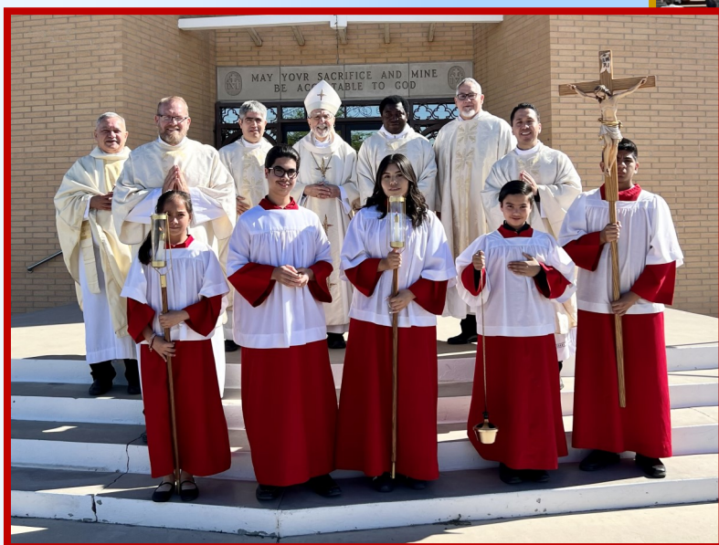
Echoes of the conference on the Eucharist given by Bishop Gerald Kicanas.